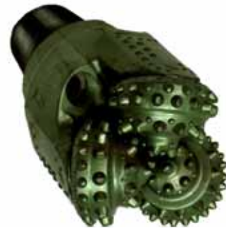
Tungsten Carbide Insert Tricones