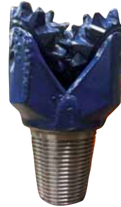
Steel Tooth Tricones

Please contact your Hole Products representative for additional details and assistance selecting the tricone bit designed to maximize performance and increase bit life under your specific drilling conditions.